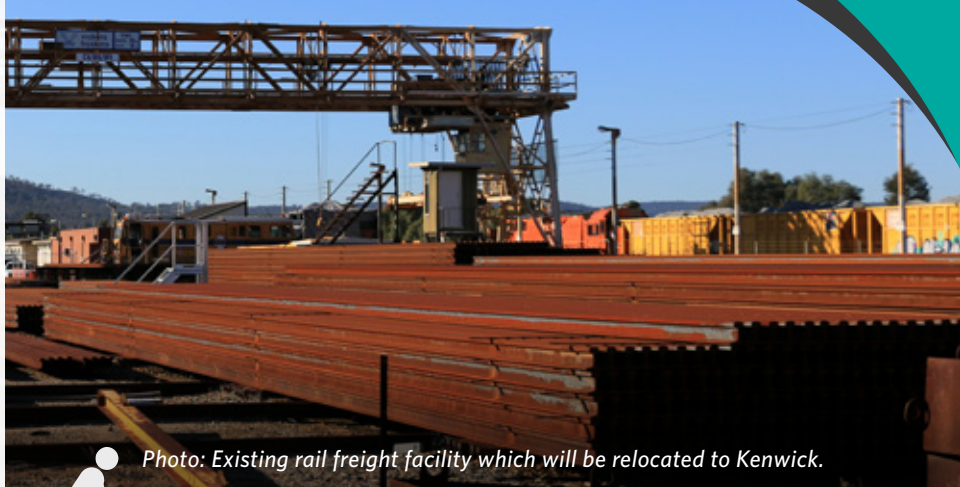
Photo: Existing rail freight facility which will be relocated to Kenwick.

As you may be aware the location of the Kenwick rail freight facility sat within an area which was earmarked to be rezoned as part of the planned Maddington Kenwick Strategic Employment Area. This rezoning from rural to industrial occurred in late-2016 and was taken into account by the PTA in the land acquisition process.