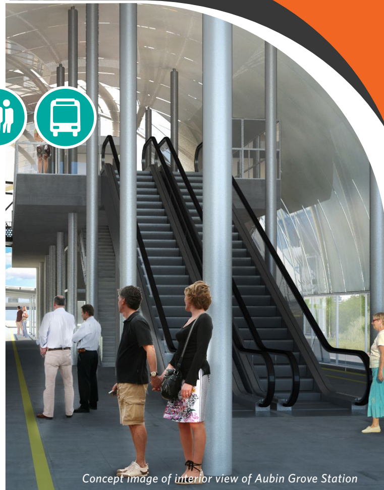
Concept image of interior view of Aubin Grove Station

Construction will begin in late 2015 and be completed in early 2017.